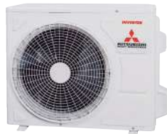
SRC15ZTL-W, SRC20ZTL-W, SRC25ZTL-W, SRC35ZTL-W