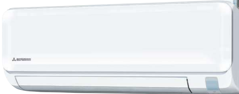
SRK15ZTL-W, SRK20ZTL-W, SRK25ZTL-W, SRK35ZTL-W, SRK50ZTL-W