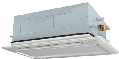
Capacities 18,000 to 24,000 Btu/hr

With a sound level down to 33 dB(A), this unit is among the quietest on the market. Individual louver control with auto-swing or fixed air exhaust angles brings conditioned comfort to a variety of room layouts.